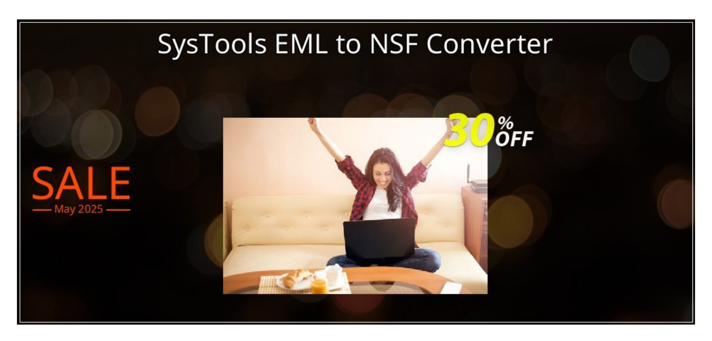
To claim this SysTools EML to NSF Converter discount now

You can get the coupon by scan QR codes below: