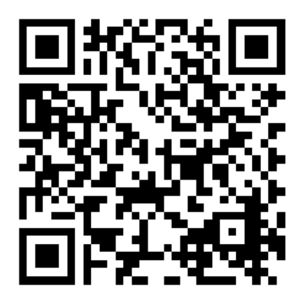
To view the price chart of PDF Postman for Outlook by the time