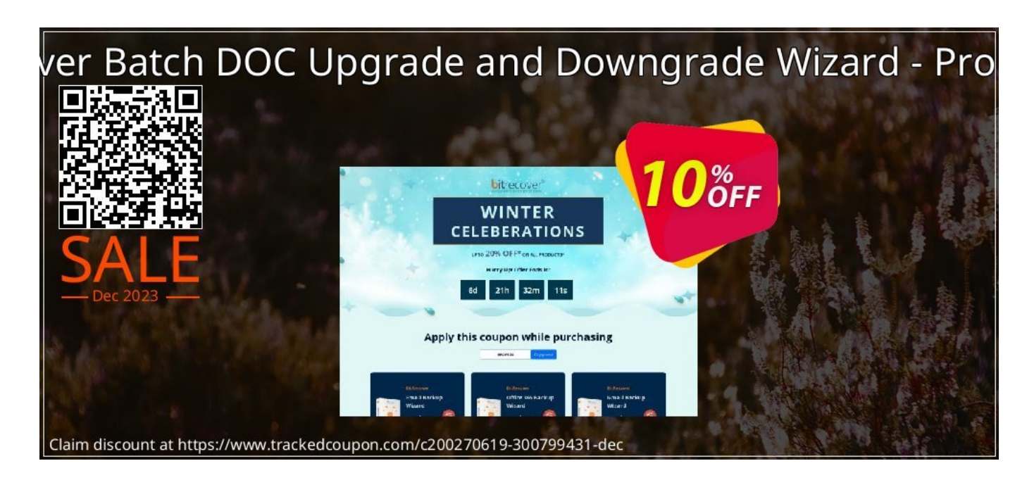
To claim this BitRecover Batch DOC Upgrade and Downgrade Wizard - Pro License discount now