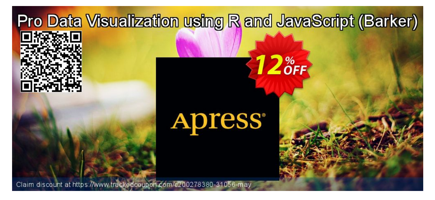
To claim this Pro Data Visualization using R and JavaScript (Barker) discount now